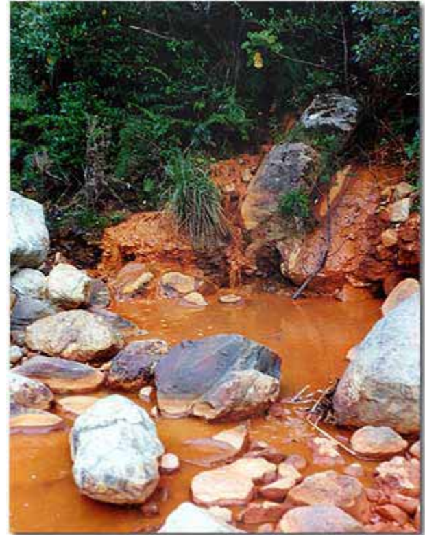
Iron rich mine leachate